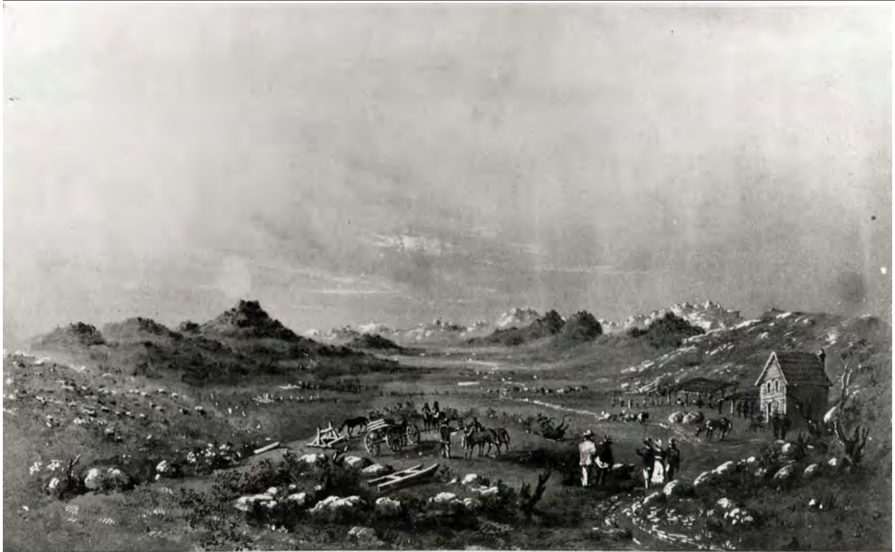
General View of SIERRA VALLEY, from Beckwourth's Pass.

Sierra Valley as viewed from Beckwourth Pass about 1860.